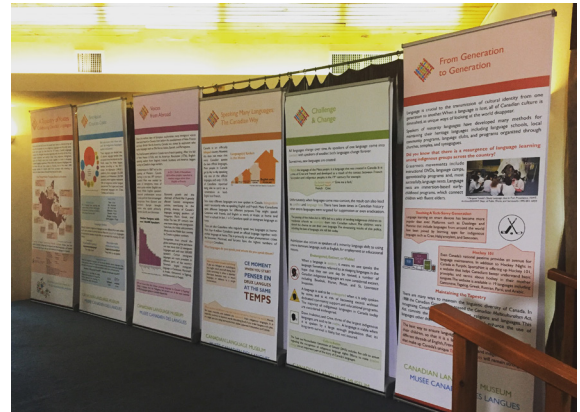
“A Tapestry of Voices” at Six Nations Polytechnic’s Indigenous Research Symposium, Ohsweken, ON