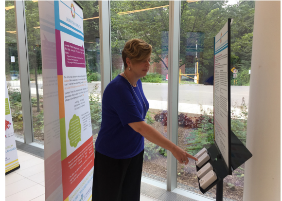
“Le français au Canada” at Glendon for the Association for French Language Studies Conference, Toronto, ON