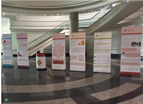
“A Tapestry of Voices” Exhibit at Canada Post in Ottawa, ON