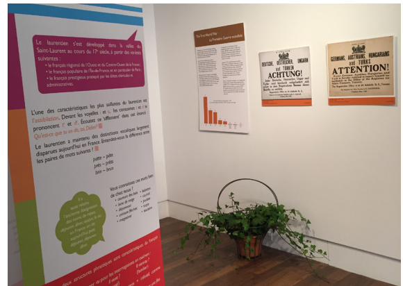
“Le français au Canada” and “Read Between the Signs” at the Canadian Language Museum, Toronto, ON