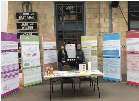
“Cree: The People’s Language” at Ontario Heritage Trust’s Dialogue on Intangible Heritage, Toronto, ON