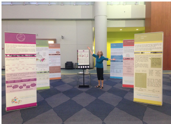
“Cree: The People’s Language” at the World Indigenous People’s Conference on Education, Toronto, ON